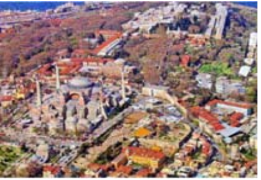
Figure 2. Noise stimulated noise