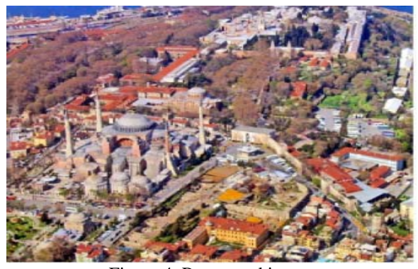
Figure 4. Recovered image